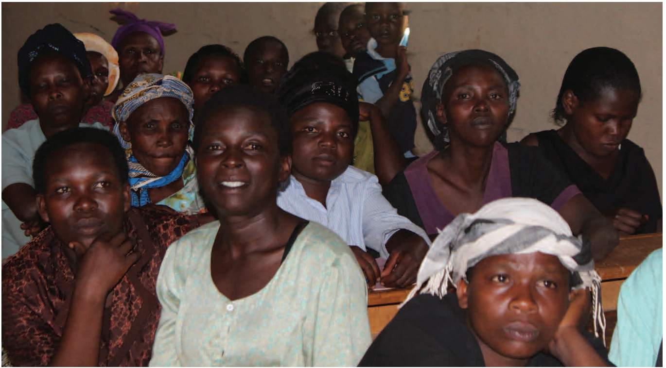
The women of Bunabudde say training has changed the way they do things, and changed attitudes, too.

The women learned about their rights to own assets, and gained skills that will enable them to fully participate as leaders and to help strengthen their cooperatives.